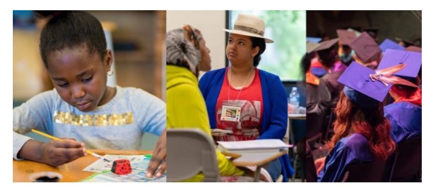
ELL Summer Enrichment, ASD/UAA Summer Bridge Program, Summer graduates

Students had a variety of opportunities to continue learning over the summer. At Chugach Optional, an enrichment program for English Language Learners wove together lessons in science, math, art, and language which bolstered learning in all academic areas. Developing relationships with teachers and each other built their confidence and developed their language skills along with other foundational tools that will help them succeed in school and life.